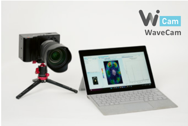
Highspeed camera Chronos 2.1 with WaveCam software by gfai tech

Optical Flow Based Time and Frequency ODS