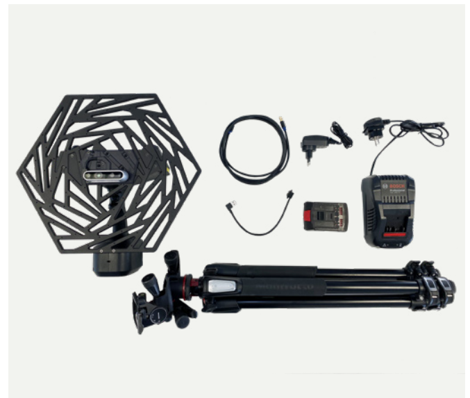
Acoustic Camera Mikado set with optional accessories

The array comes with an integrated Intel® RealSense™ depth camera which features Full HD resolution and the ability to record depth information.