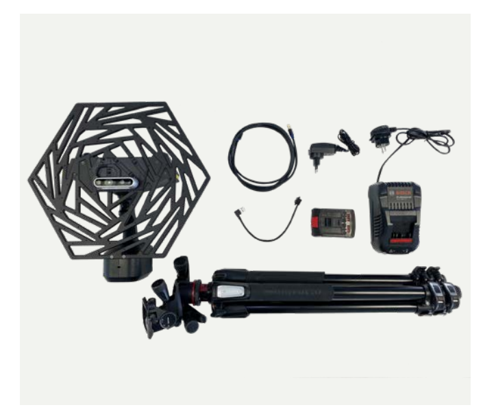
Acoustic Camera Mikado set with optional accessories

The array comes with an integrated Intel<sup>®</sup> RealSense<sup>™</sup> depth camera which features Full HD resolution and the ability to record depth information.